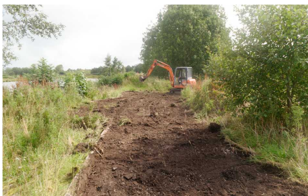
'Breaking ground' for the new viewing screens (September, 2019).

part of the reserve which had fallen into disrepair and, in places, was frankly dangerous. We were fortunate in obtaining a grant from the Lancashire Environmental Fund to improve the latter and they were so impressed by our vision, and advance planning for further phases, that a further £20,000 was made available for us to open up the old compound off Preston Road, put in a ramp for access by all prospective visitors and erect viewing screens that overlooked both of the two main reservoirs.