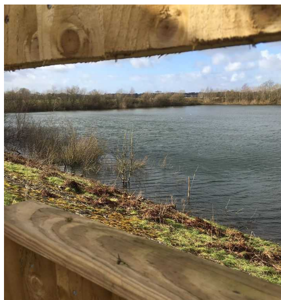
Scrub and waterlogged-willow were cleared from the embankments to provide unimpeded views of the reservoirs (February, 2020).

area as well as to drag out, and dispose of, some of the waterlogged willows that were preventing good views of Reservoir 1.