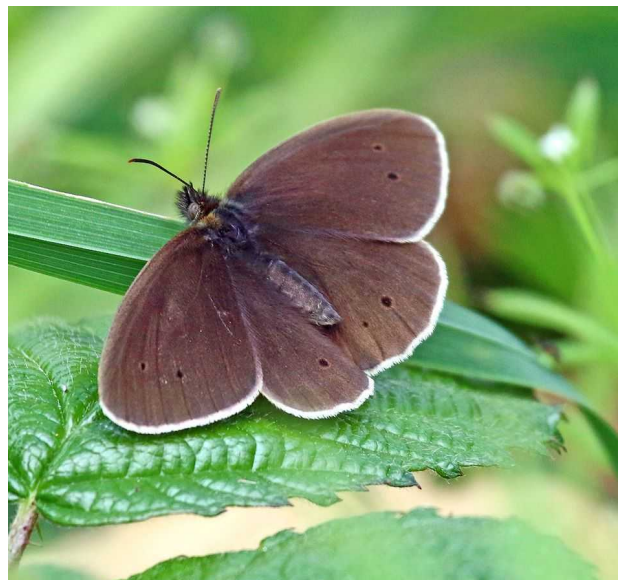
Ringlet butterfly on the Wetlands (photograph by Richard Moss, July 2019).

accelerating pace of climate change. Against this background, it is pleasing to report that one species of butterfly, the Ringlet, is apparently thriving on the Wetlands.