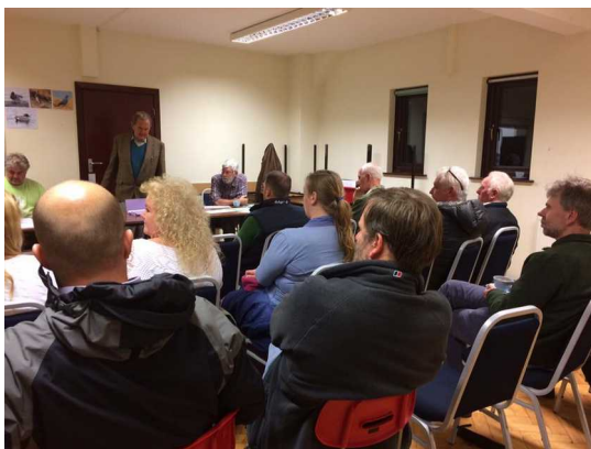
The call for volunteers (Grimsargh Village Hall, September, 2017).

The Trust was given charitable status in July 2017 and planning for a long-term programme of work to improve both the biodiversity of the site and accessibility for the local community was undertaken by the trustees. A key aspect of this plan was that, in contrast to many other similar sites around the country, there are no paid employees of the Trust. All work undertaken would need to be done either by volunteers from the local community or by contractors employed using funds secured by the fund-raising activities of the Trust or by successful grant applications, submitted by the Trust, to external agencies and funding bodies.