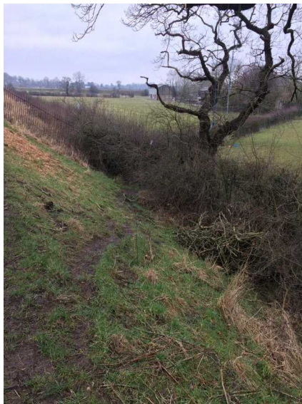
The 'pathway' leading, off the Wetlands, to the stile and fields beyond – now replaced by steps (March, 2018).