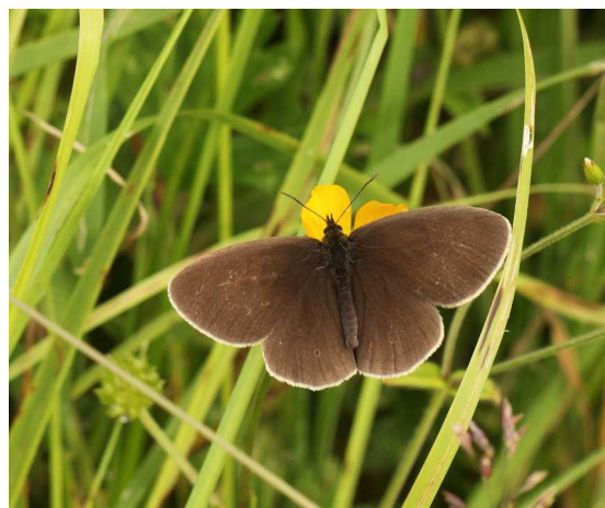
Ringlet with only one pair of faint rings/spots (June, 2019).