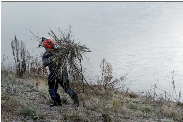
Goosnargh Tree Services at work clearing scrub on a cold and frosty morning (December, 2019).

We have cleared a small section of the embankment near the screens to expose the underlying masonry which shows the site's industrial heritage, coming up to 200 years old now, and forms a different micro-habitat.